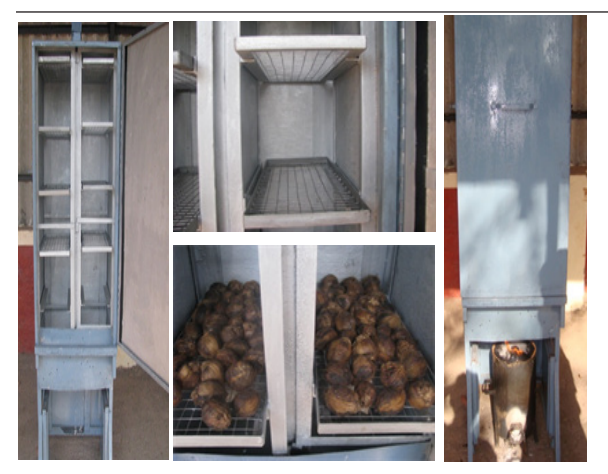
Figure 3. DBSKKV developed Waste-fired dryer

Similar test was carried out on arecanut kernel (husk removed). The Table 4 shows colour of areca nut kernel. The L, a & b values were at par. It indicates that the quality of both the kernels was at par.