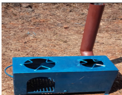
Figure 2. Developed cook stove after fabrication.

by conducting Water Boiling Test (WBT) for different biomass such as mango sticks and acacia sticks. The known quantity of water was heated from ambient temperature to the boiling temperature of water. The pre measured quantity of biomass was burned in the cook stove and water evaporated was measured. The summation of the sensible heat required for the water heating and latent heat of vaporization of evaporated water were treated as the output of the cooking stove. The amount of heat supplied by the fuel during the testing was treated as input to the cook stove. During the test, various parameters were measured such as flame temperature, stove surface temperature, ash and water temperature. The testing of developed cooking stove was conducted in natural as well as supplementary secondary air convection. The actual cooking test of the newly developed stove was carried out by conducting the cooking test for local food items. The emissions